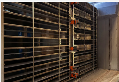
Figure 2. AHU-2 w/ Channel Blender installed